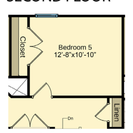
Bedroom 5 Option